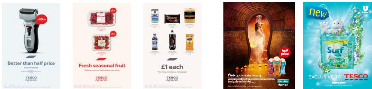
Examples of Shopper Marketing Campaigns / Trade Promotional advertising

This includes reference to price and the use of all TESCO branded assets such as price pings / roundels, TESCO copyright material, Offers, Promotional Terms & Conditions and all logos.